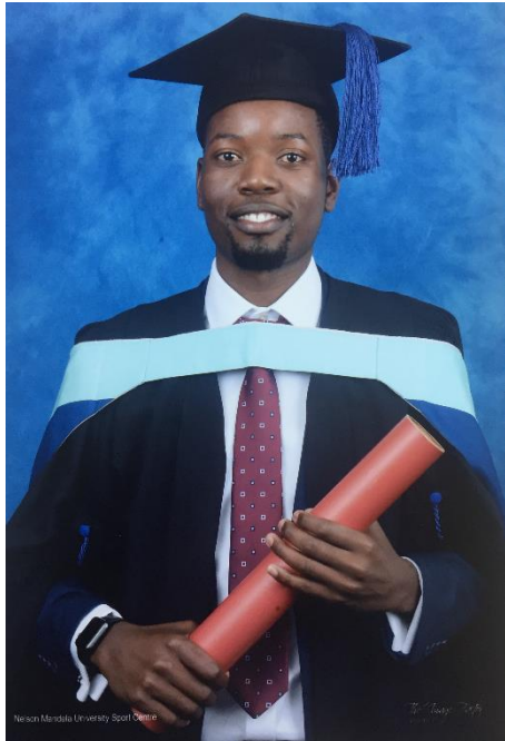
2017 Mandela University SAIEE Student Chapter President

It is with great pleasure to write yet again another president's message after a successful and fun filled 2017. A couple of students joined the SAIEE as student members and several student chapter events took place. We managed to hold our second successful Annual event following the failure to host one in 2016 due to the unforeseen 'fees must fall' movement.